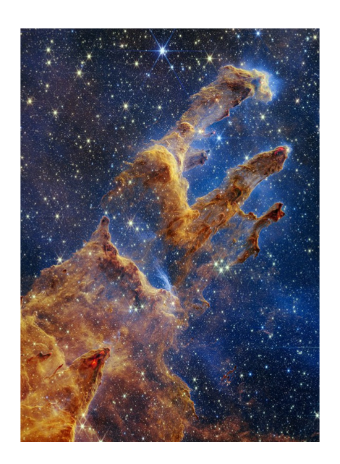
"The Pillars of Creation" by James Webb Space Telescope is licensed under CC BY 2.0.

At our CC Global Summit, participants drafted <u>community-driven principles</u> on AI that are a valuable input and will help inform the organization's thinking as we determine CC's exact role in the AI space.