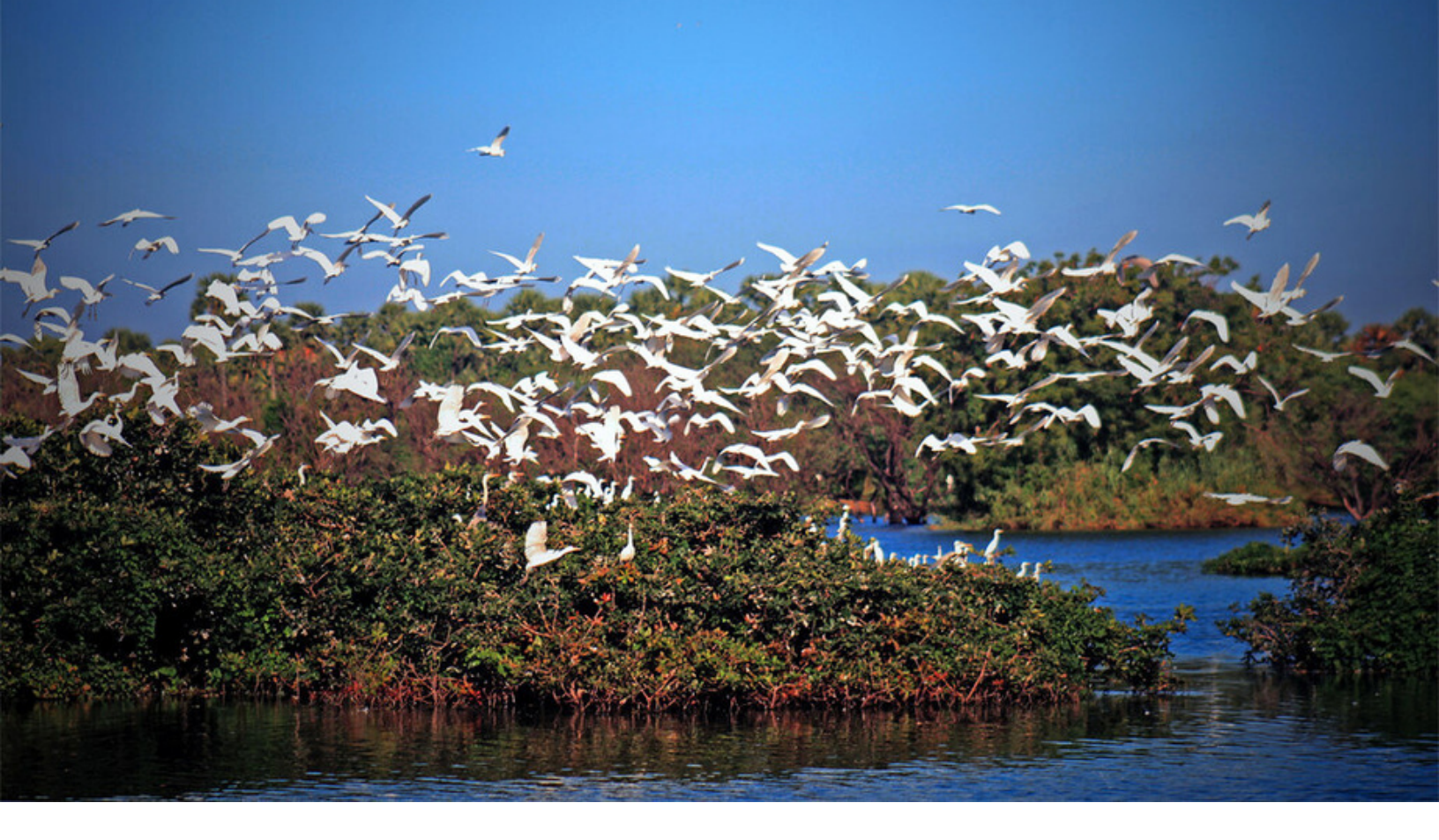
"bird flock in vedanthangal" by VinothChandar is licensed under CC BY 2.0.