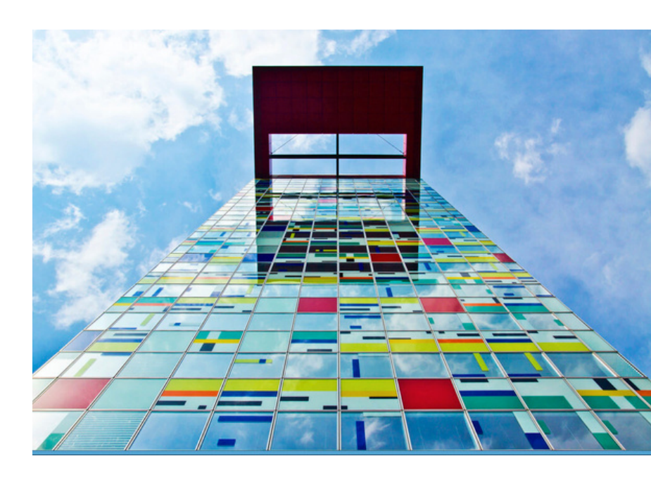
"Follow the Color Brick Road" by Bert Kaufmann is licensed under CC BY-SA 2.0.

We delivered workshops and presentations on CC Licenses and Open Educational Resources at over 16 conferences and events. The CC Open Education Platform also funded six global projects, including work to advance the UNESCO Recommendation on OER.