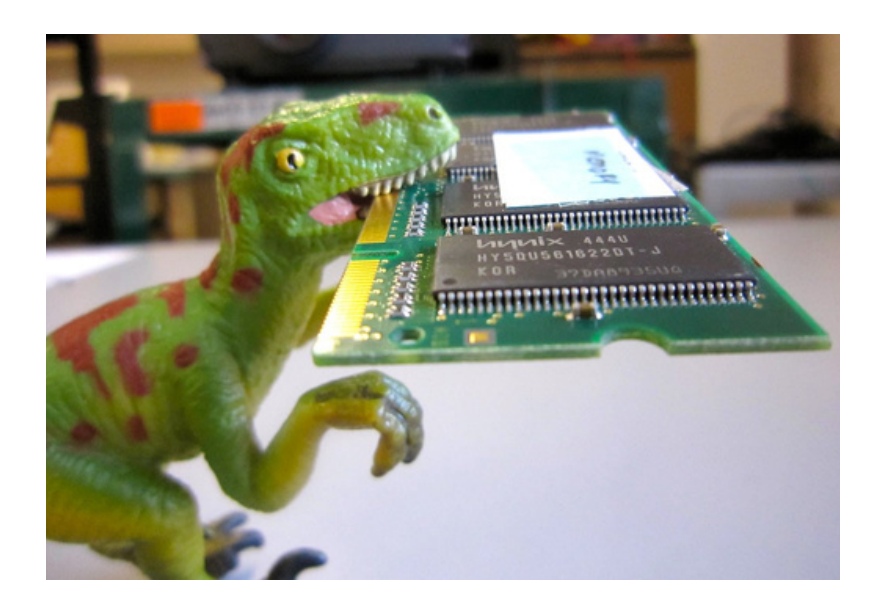
"The great growling engine of change - technology. Alvin Toffler"

Our legal and technology staff continued to make key infrastructure updates and manage daily maintenance to ensure these Licenses work for everyone.