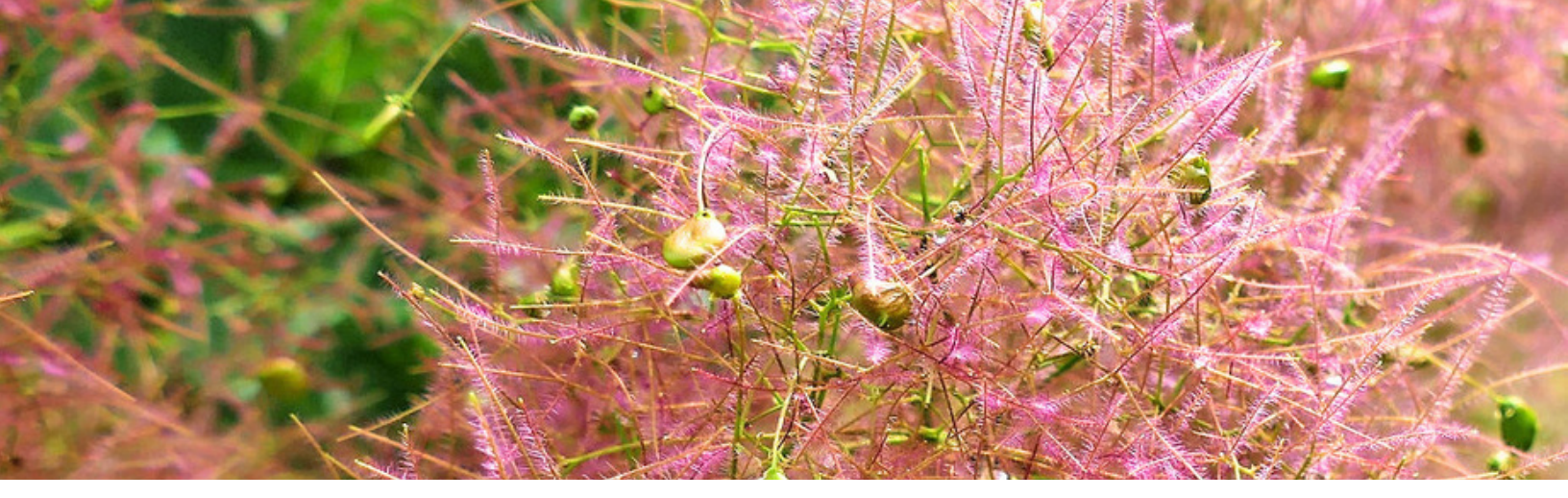
"great colors of nature"